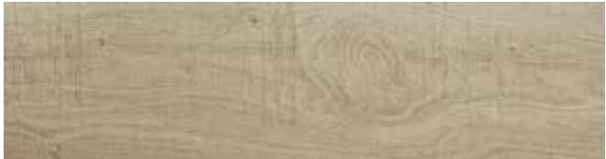
WHITSUNDAYS1143 Long Island Oak