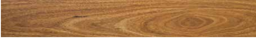
PENINSULA1161 Dromana Spotted Gum