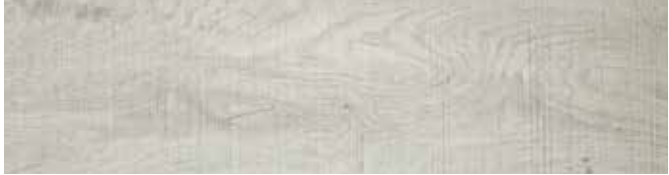
WHITSUNDAYS1147 Daydream Oak