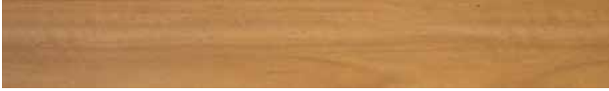
PENINSULA1164 Boneo Blackbutt