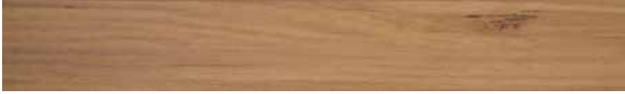
PENINSULA1163 Sorrento Blackbutt