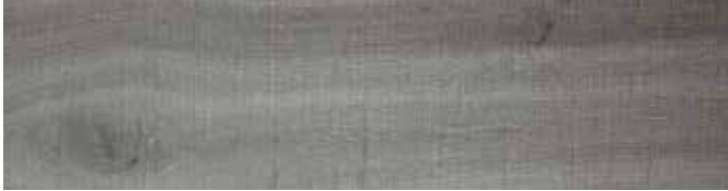
WHITSUNDAYS1148 Lindeman Oak