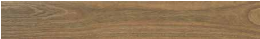
PENINSULA1160 Portsea Spotted Gum