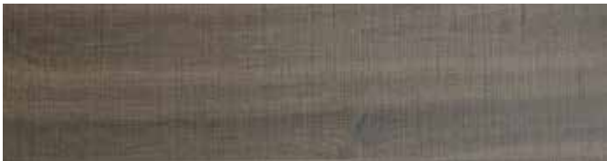
WHITSUNDAYS1141 Brampton Oak