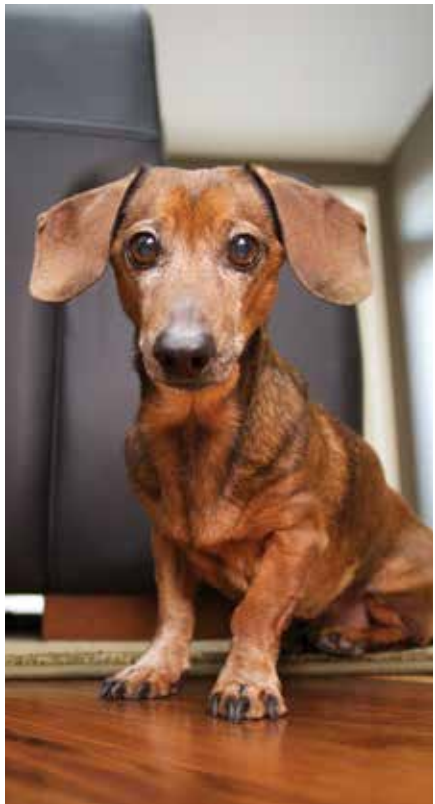
Dromana Spotted Gum