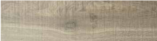
WHITSUNDAYS1144 Hayman Oak