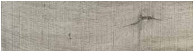
WHITSUNDAYS1140 Hamilton Oak