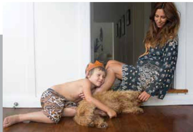
Beleura Spotted Gum

AquaPlank ® is extra hard wearing Clear, enhanced UV cured coating – scratch resistant – stain resistant – burn resistant – anti-bacterial