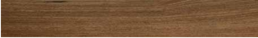
PENINSULA1162 Flinders Spotted Gum