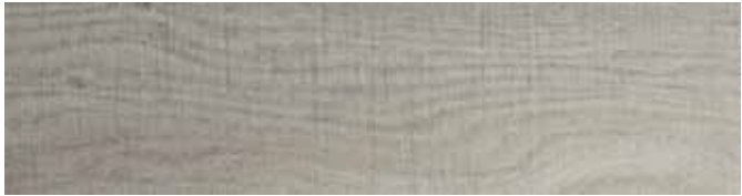
WHITSUNDAYS1145 Airlie Oak