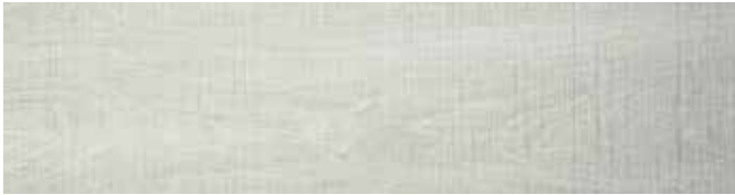
WHITSUNDAYS1146 Whitehaven Oak