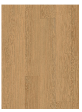
PURE OAK HONEY