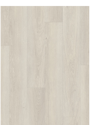
SEA BREEZE OAK LIGHT