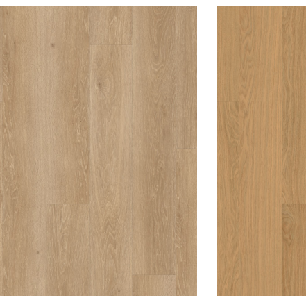
SEA BREEZE OAK NATURAL