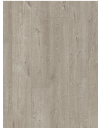
COTTON OAK WARM GREY