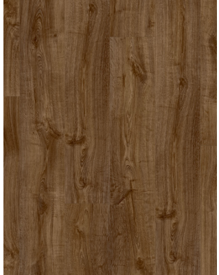
AUTUMN OAK BROWN