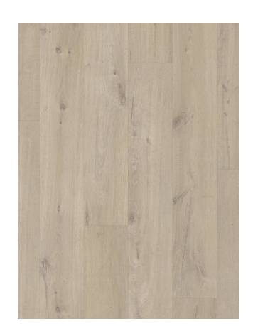
COTTON OAK BEIGE