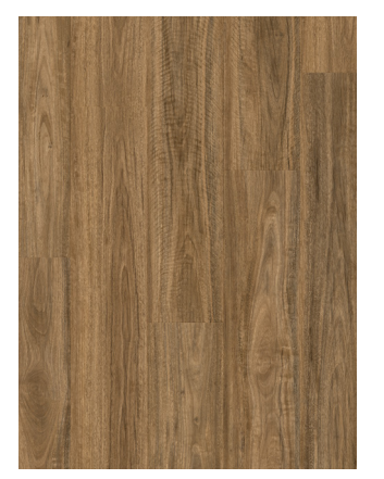
WILD SPOTTED GUM