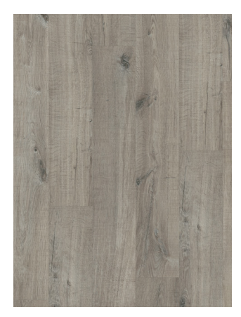
COTTON OAK GREY WITH SAW CUTS