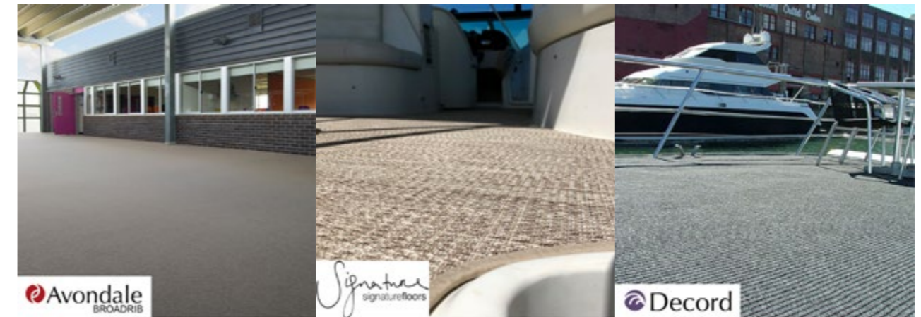
Nolan Hobnail Marine Carpet